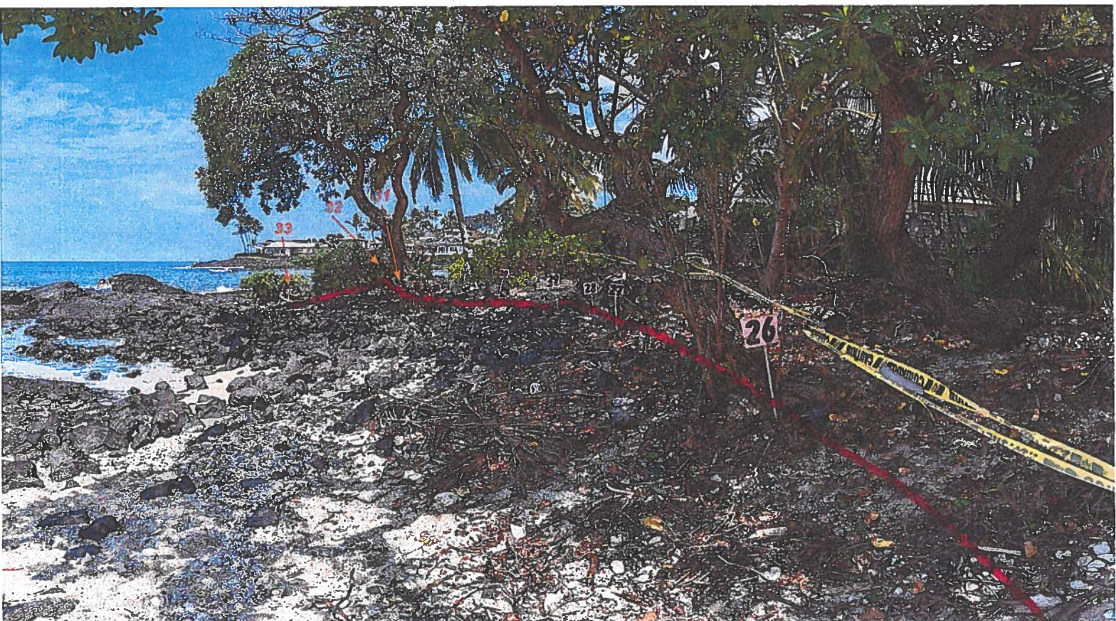
PHOTOGRAPH NUMBER 3