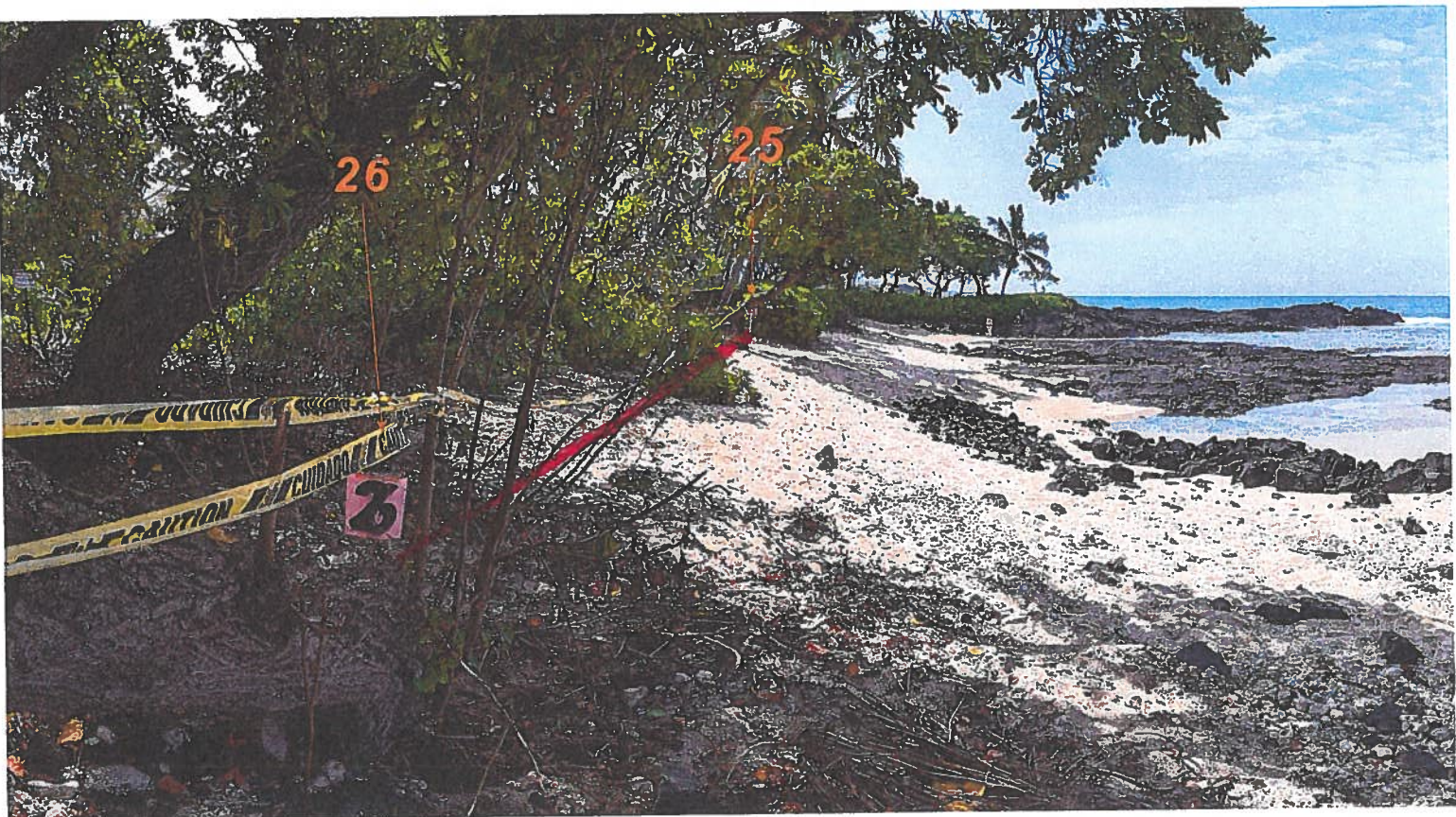
PHOTOGRAPH NUMBER 2

DATE OF PHOTOGRAPHS: MARCH 27, 2026 TIME OF PHOTOGRAPHS: 11:00 A.M.