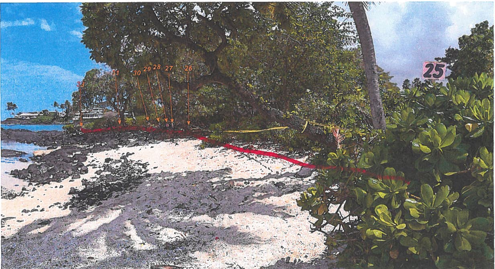
PHOTOGRAPH NUMBER 1

DATE OF PHOTOGRAPHS: MARCH 27, 2026 TIME OF PHOTOGRAPHS: 11:00 A.M.