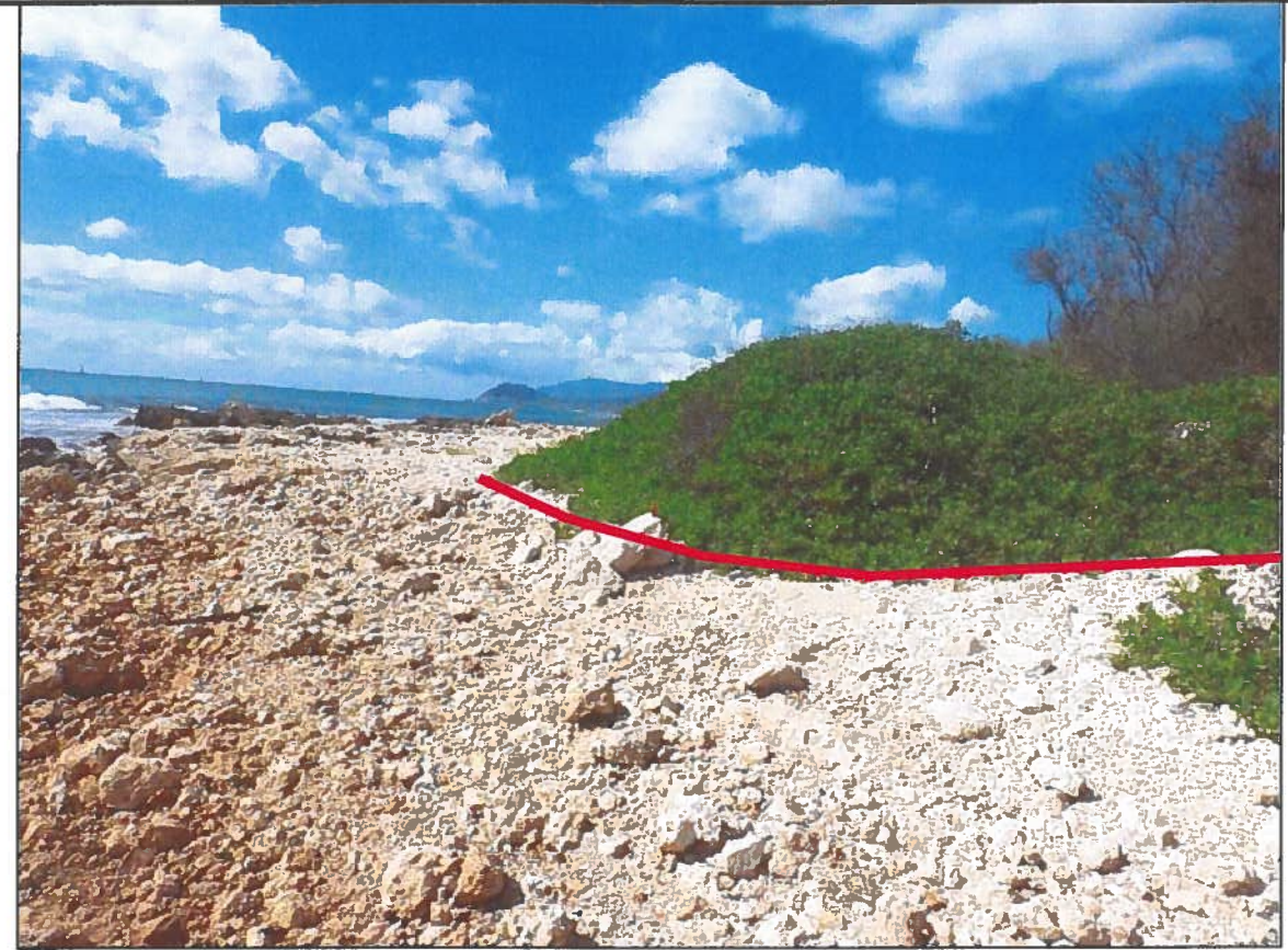
Date: March 30, 2026 Time: 3:41 PM