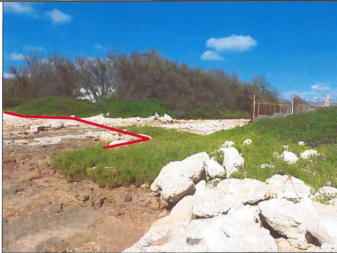
Date: March 30, 2026 Time: 3:40 PM