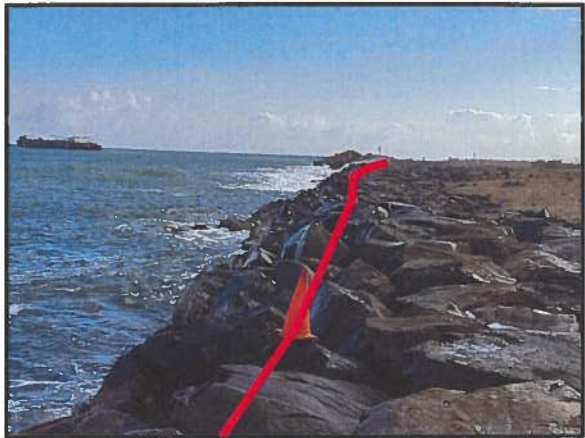
②⇒ Date: November 7, 2025 Time: 8:12 AM