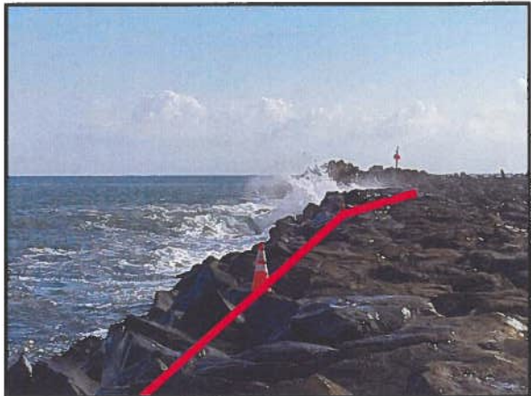
④⇒ Date: November 7, 2025 Time: 8:17 AM