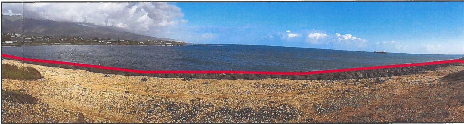
⑤⇒ Date: November 7, 2025 Time: 8:19 AM