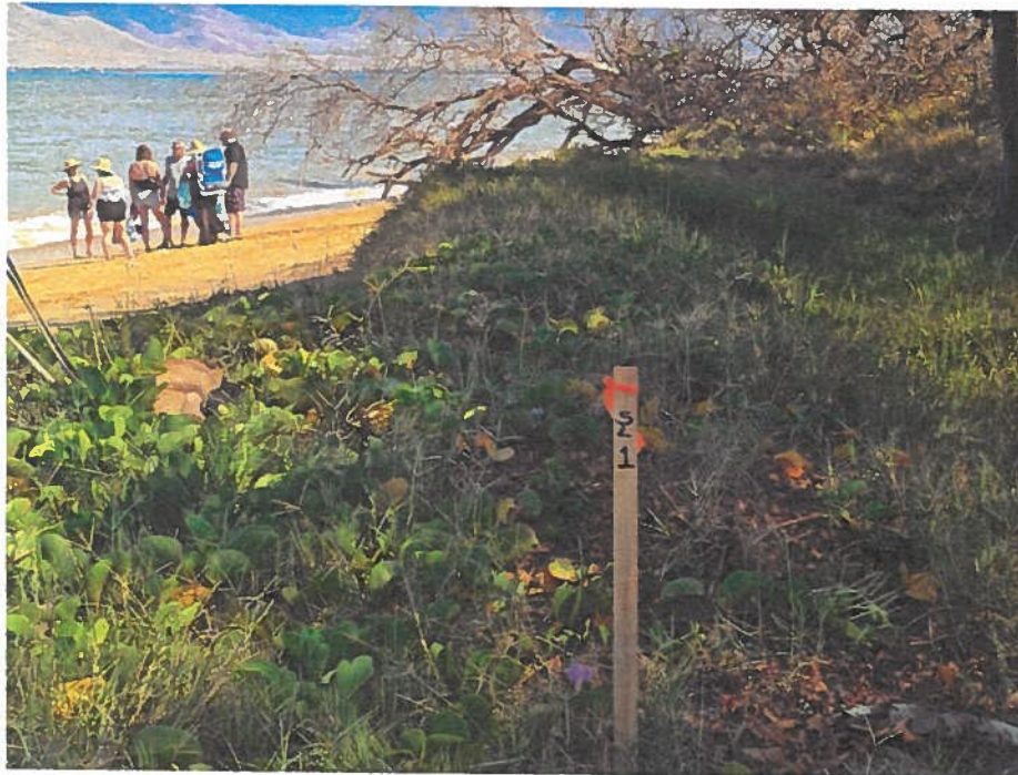
1B - Photo Taken 2025-07-03 9:30AM