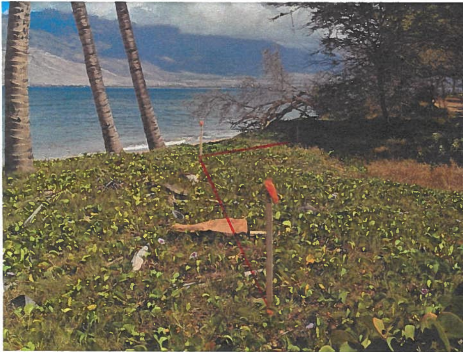
3B - Photo Taken 2025-07-03 9:30AM