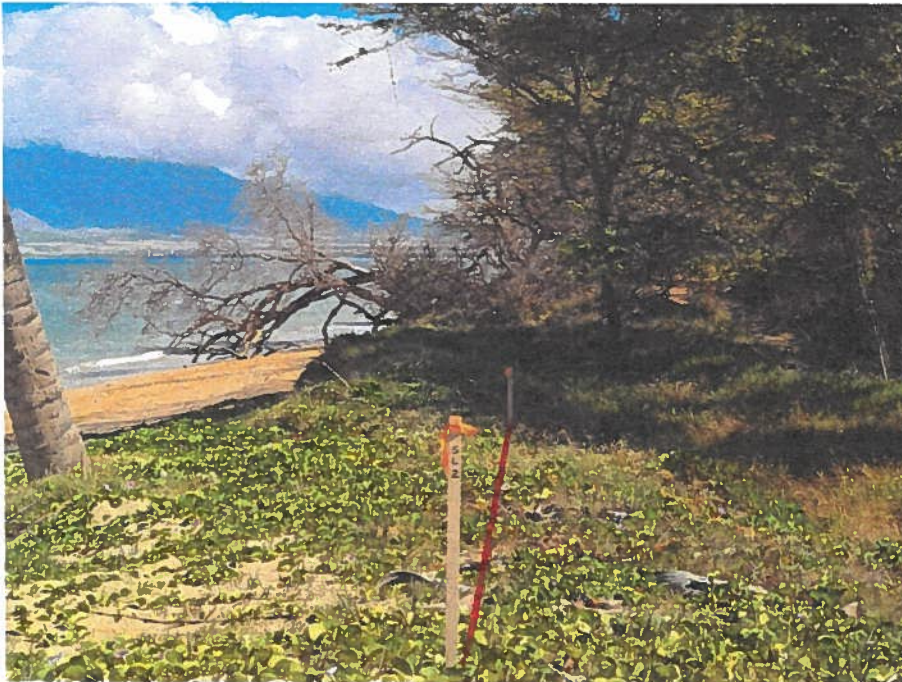
2B - Photo Taken 2025-07-03 9:30AM