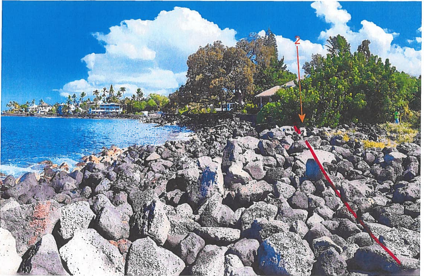
PHOTOGRAPH NUMBER 2