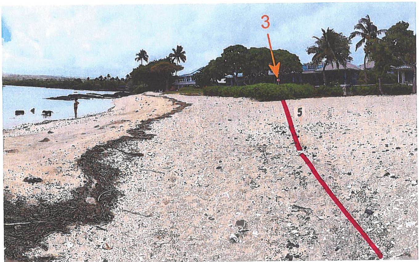
PHOTOGRAPH NUMBER 3