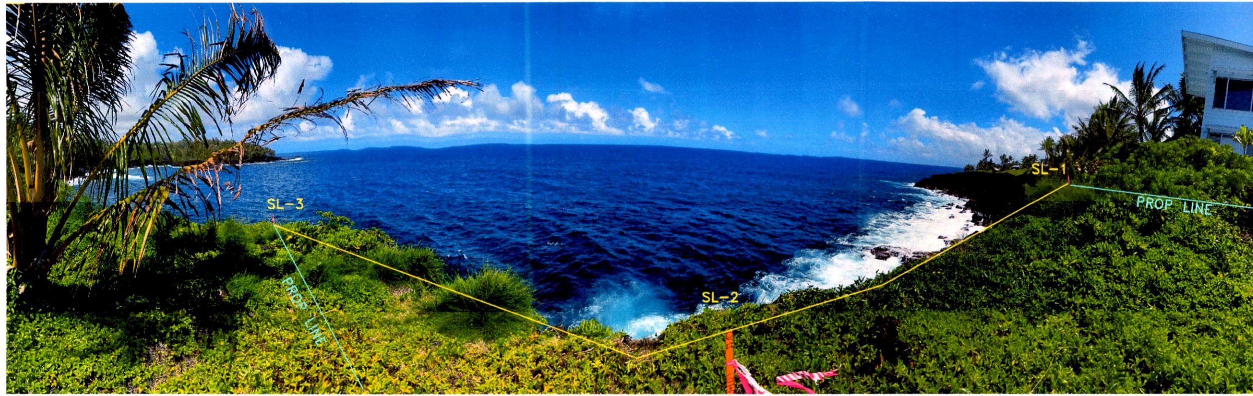
PANORAMIC TAKEN MAY 14, 2024, 9 A.M.