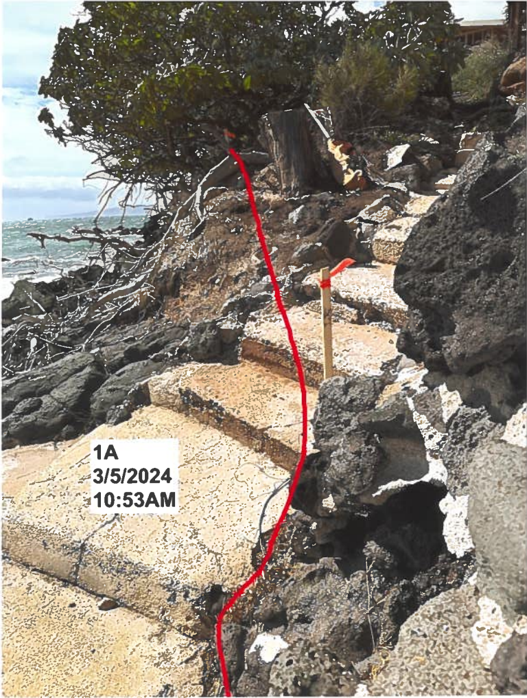
1A 3/5/2024 10:53AM