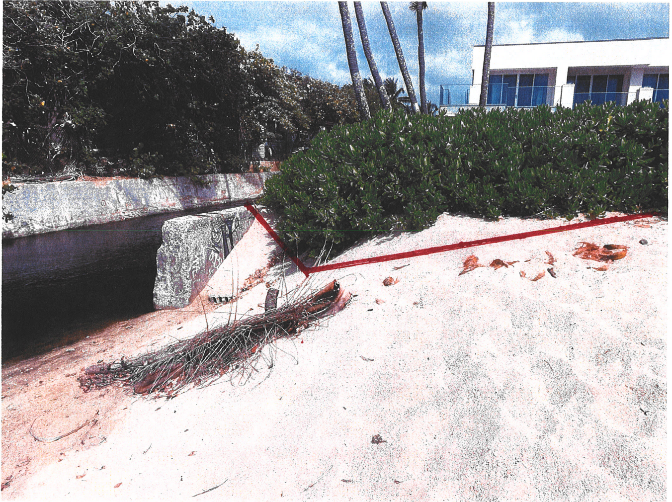
Photo 3 Parcel 13 Being Lot 14-B 4801 E. Kahala Avenue T.M.K. : (1)3-5-59 : parcel 13 July 3, 2023 Time 11:06am

Shoreline Follows along bottom break and edge Vegetation and Top Break as located on July 3, 2023