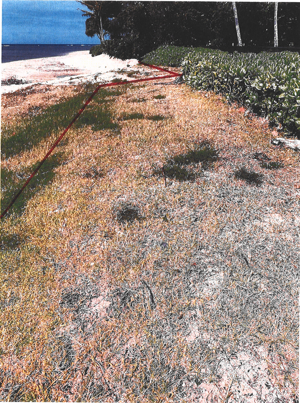
Photo 1 Parcel 13 Being Lot 14-B 4801 E. Kahala Avenue T.M.K. : (1)3-5-59 : parcel 13 July 3, 2023 Time 11:06am

Shoreline Follows along bottom break and edge Vegetation and Top Break as located on July 3, 2023