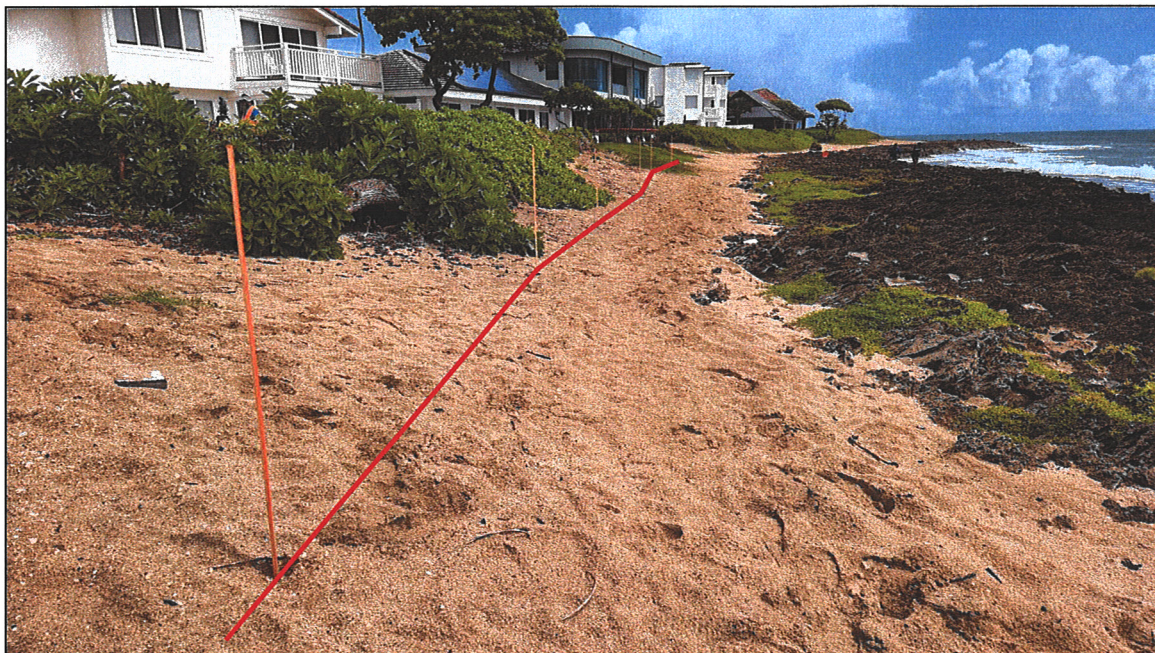
PHOTOGRAPH 1 (7/24/23 10:45 AM)