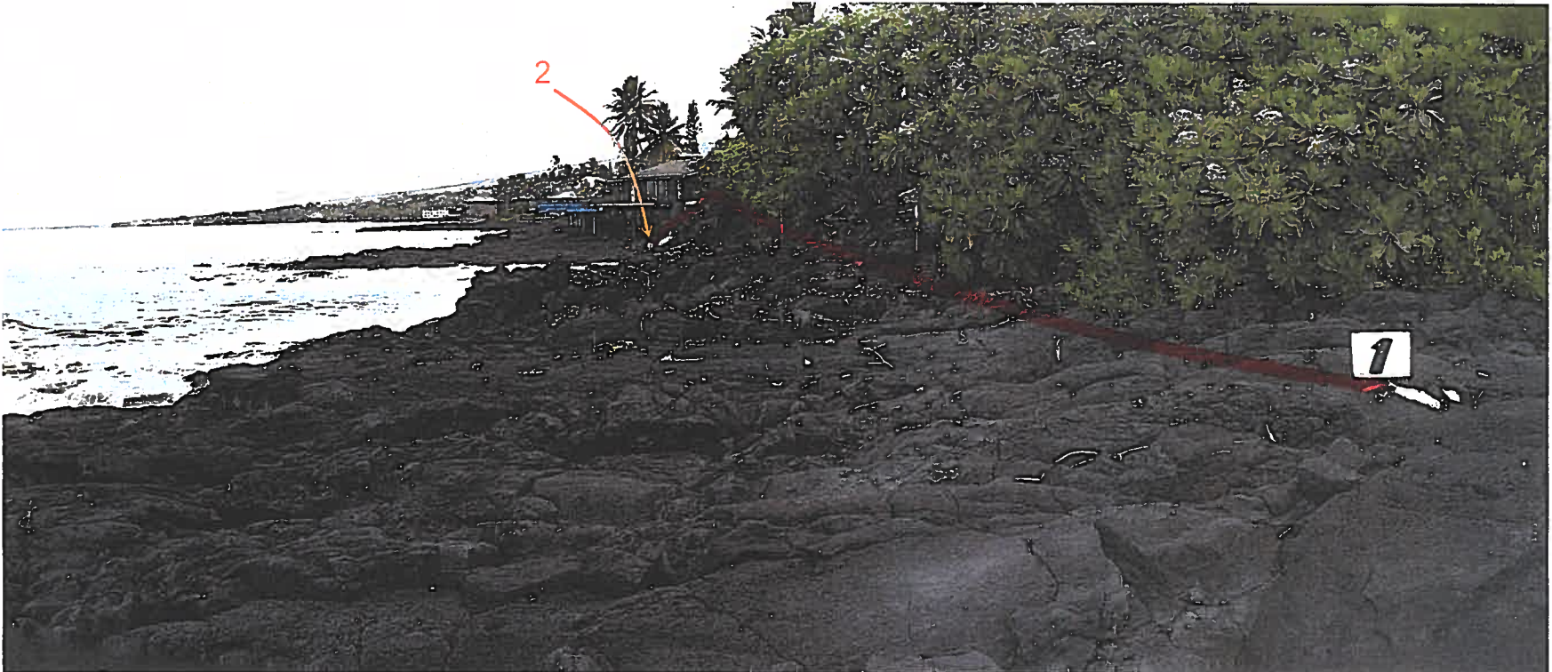
PHOTOGRAPH NUMBER 1

DATE OF PHOTOGRAPHS: OCTOBER 21, 2020 TIME OF PHOTOGRAPHS: 8:30 A.M.