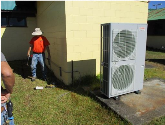
Kulani Correctional Facility Heating