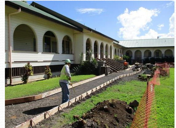
DOE Annex Hilo Repairs