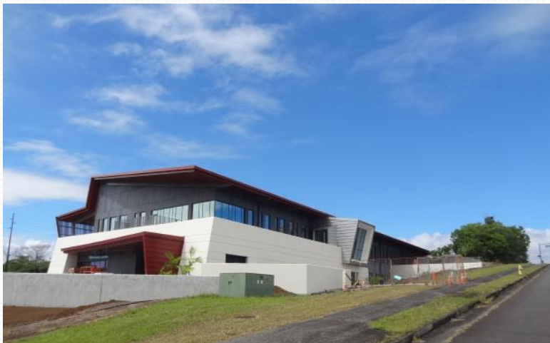
Constructed Facility as of Sep 2019

Daniel K. Inouye College of Pharmacy University of Hawai'i Hilo Projected Occupancy Date: Nov 2019