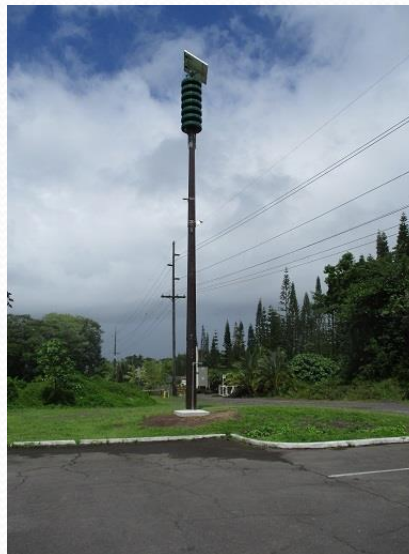
HiEMA Warning Signals