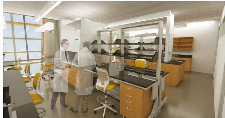
Rendering of the lab space.