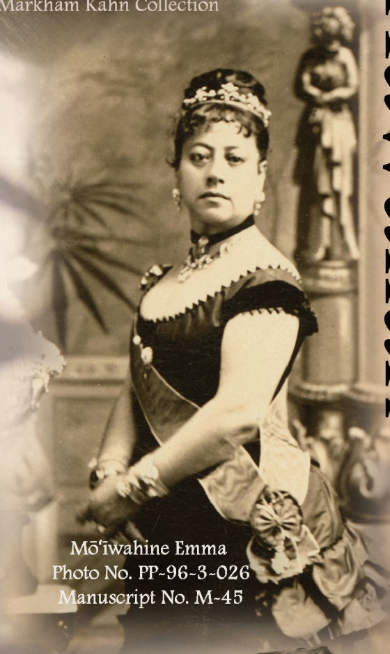
Mō'iwahine Emma Photo No. PP-96-3-026 Manuscript No. M-45