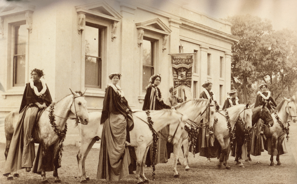
Pā'u Riders Photo No. PP-34-3-002 Photo Collection