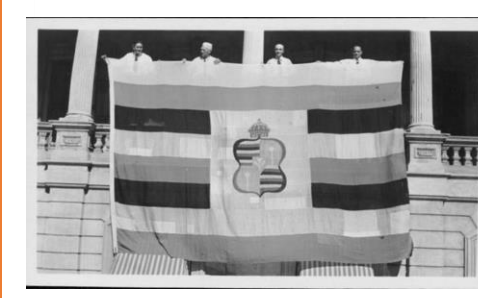
Royal Standard of Hawai'i from the reign of King Kalākaua.