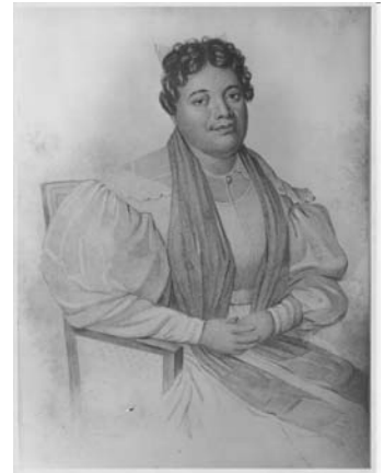
Kekāuluohi, Kuhina Nui