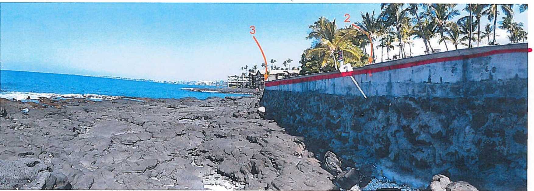
PHOTOGRAPH NUMBER 2