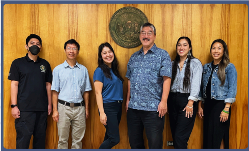
Office of Enterprise Technology Services, DAGS Client Services Branch

The EFS Department Engagement Spotlight is a recurring newsletter feature showcasing the various departments that the EFS team regularly engages with. This month, we are proud to highlight staff members from the Client Services Branch of the Office of Enterprise Technology Services (ETS) , a division of the Department of Accounting and General Services (DAGS).